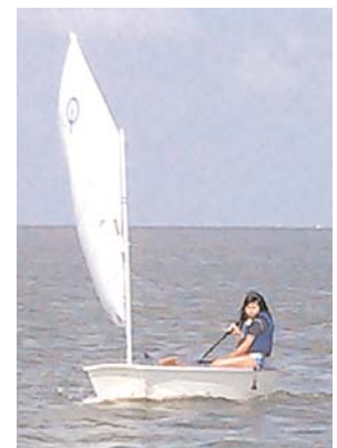
A lone Opti sailor braved the winds to sail in the Trick or Treat Regatta to end the year