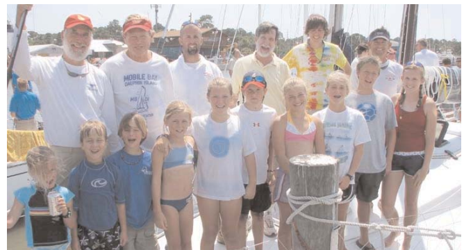
White Trash took honors in the DI race with Juniors at the helm in May