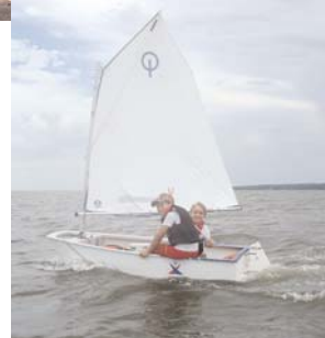
Summer Sailing Camp introduced a new group of juniors to sailing