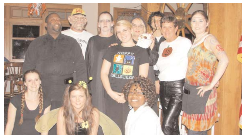
The staff got right into the spirit of the night with costumes of their own.