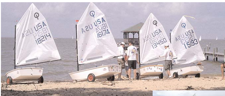
Dogwood in March started our season