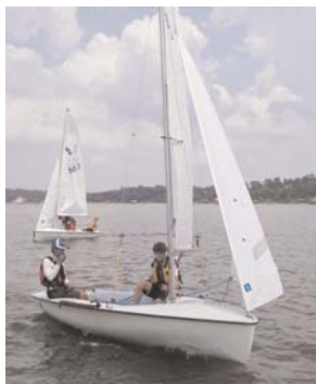
420's participated in the Children's Hospital race in August