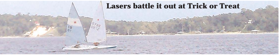
Lasers battle it out at Trick or Treat