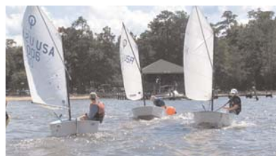
The Wadewitz in September brought juniors from around the GYA to compete